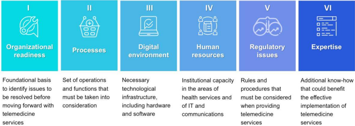
FIGURE 1: Categories to consider in assessing the maturity of health institutions to implement telemedicine services