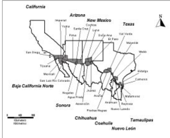
Figure 1: The Sister Communities on the United States-Mexico Border

deaths in this cause group on the United States side. Also, it is of interest to note that accidents and adverse effects were the leading causes of death in all age groups up to 45 years of age (1–4, 5–14, 15–24, and 25–44) on both sides of the border.