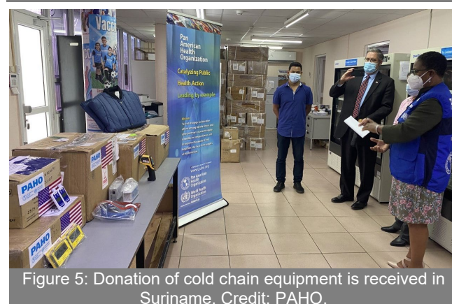
Figure 5: Donation of cold chain equipment is received in Suriname.