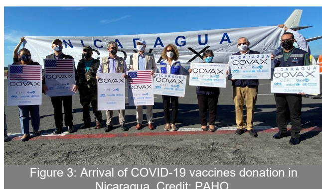
Figure 3: Arrival of COVID-19 vaccines donation in Nicaragua.