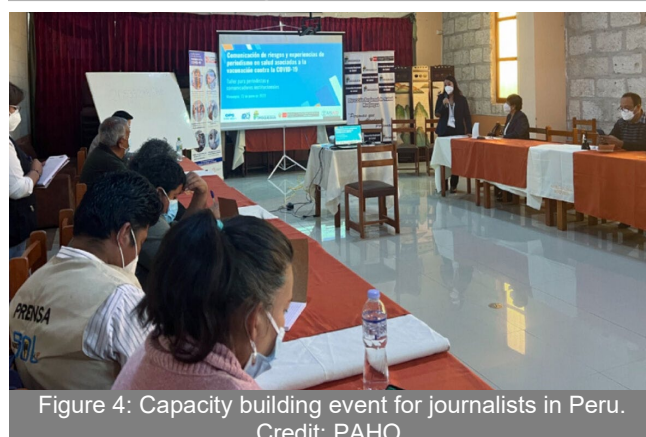
Figure 4: Capacity building event for journalists in Peru.