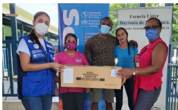
Figure 8: Schools receive masks for the control of COVID-19 transmission in Costa Rica.

In Costa Rica , from 16 to 24 June, PAHO delivered a donation of 5,400 surgical masks to be used in the prevention of SARS-Cov-2 transmission in three different schools in the canton of Talamanca.