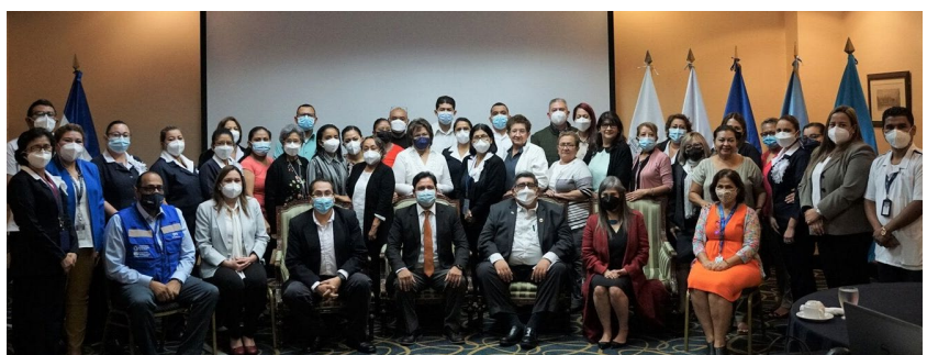
Figure 1: MoH Regional Health Officers are trained on different topics related to COVID-19 vaccines in El Salvador.

In El Salvador , on 21 and 22 June 2022, PAHO in collaboration with international partners organized a series of workshops delivered to 40 professionals from Regional Health Offices of the Ministry of Health. Topics addressed include technical guidelines, ESAVI surveillance, cold chain management, and related subjects