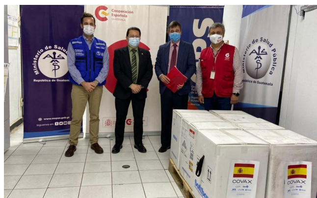
Figure 2: PAHO delivers COVID-19 vaccines donated to Guatemala through COVAX.

In Suriname , on 30 June 2022, PAHO donated equipment to the Bureau of Public Health (BOG) to strengthen the cold chain capacity of the National Immunization Program. Material delivered will help maintain the quality of COVID-19 and other vaccines in use in Suriname. The donation consisted of 300 Electronic Temperature Loggers, 4 Remote Temperature Monitoring Devices, 15 Digital Laser Thermometers, 150 User Programmable Data Loggers and 4 Cryo-resistant Jackets.