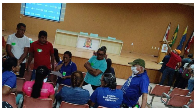
Figure 7: Health professionals trained in the management of post COVID-19 conditions in Brazil.

In Brazil , from 16 to 29 June 2022, PAHO supported the preparation of training sessions on post COVID-19 assistance in the city of Santarém, Pará. The Organization participated in a technical group that developed integrated care flows and support material for updating recommendations on post COVID-19 conditions for the training of community health agents. A total of 156 healthcare workers were trained during two different sessions. Additionally, from 27 to 29 June 2022, a PAHO team participated in discussions with the Coordination of Influenza, COVID-19, and other respiratory viruses of the Ministry of Health to prepare the supporting documents for implementing COVID-19 case management guidelines in the Unified Health System (SUS) network. The documentation includes orientation for the use of therapeutics, taking into consideration drug interactions, degree of risk, and time of presentation of the disease.