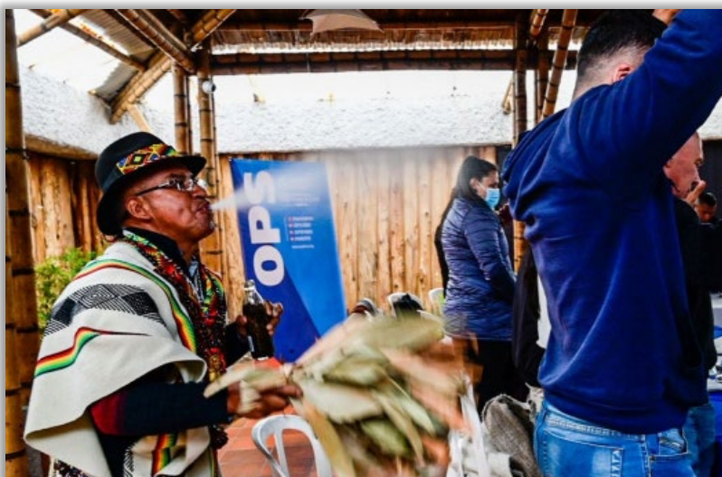
Figure 1: Representatives from indigenous communities participate in presentation of PAHO project in Colombia.

In Colombia , on 9 June 2022, PAHO announced a project on health communication to promote COVID-19 vaccination in indigenous communities in the department of Nariño . This is the second phase of the project, which will be directed at the indigenous communities of Quillacingas, Pastos, Nasa, Eperara siapidara, Kofan, Ingas and Awá, and will run until the first quarter of 2023. The aim of the project is to implement a communications strategy with an ethnic approach to provide information on preventive measures to avoid contagion and dissemination of COVID-19. It will also emphasize the importance of vaccination and build institutional capacities to strengthen surveillance of COVID-19, other vaccine preventable diseases and events supposedly attributable to vaccination or immunization (ESAVI). The project also aims to produce knowledge and learn from this experience in order to replicate it in other communities and territories in the country. The first phase of the project included the production of communication material with an ethnic approach, the promotion of dialogues and training of young people and social leaders to become replicators of messages to prevent the transmission of COVID-19 and encourage vaccination in the Awá indigenous community.