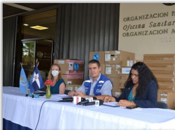
Figure 3: Official ceremony receives donation of PPE and electronic equipment in the Dominican Republic.

In the Dominican Republic on 9 June 2022, PAHO delivered a donation of personal protective equipment (PPE) and electronic and computer equipment to strengthen response to COVID-19. The items will support strengthening of epidemiological surveillance and diagnostic capacities, based on priorities identified by the Ministry of Public Health.