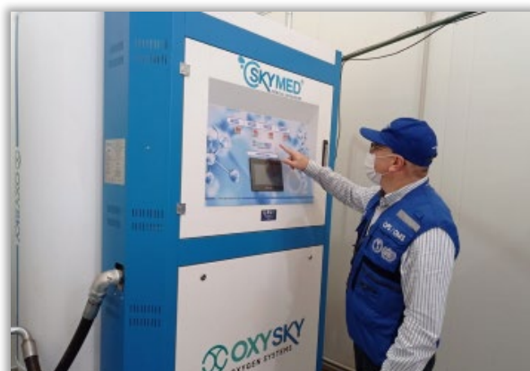
Figure 2: Oxygen plant is donated by PAHO to Paraguay.

In Costa Rica on 14 June 2022, PAHO presented to the Ministry of Health the report "Structure, composition and dynamics of the health workforce in Costa Rica in the context of COVID-19". The document was prepared by PAHO, in collaboration with the Human Resources for Health Unit (URHUS) and the Technical Commission for Human Resources in Health Development (CTDRHUS). The meeting also resulted in an agreement for the planning of future activities, including the creation of