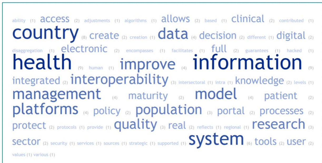
Figure 4. Tag Cloud Question 2: Strategic Thinking