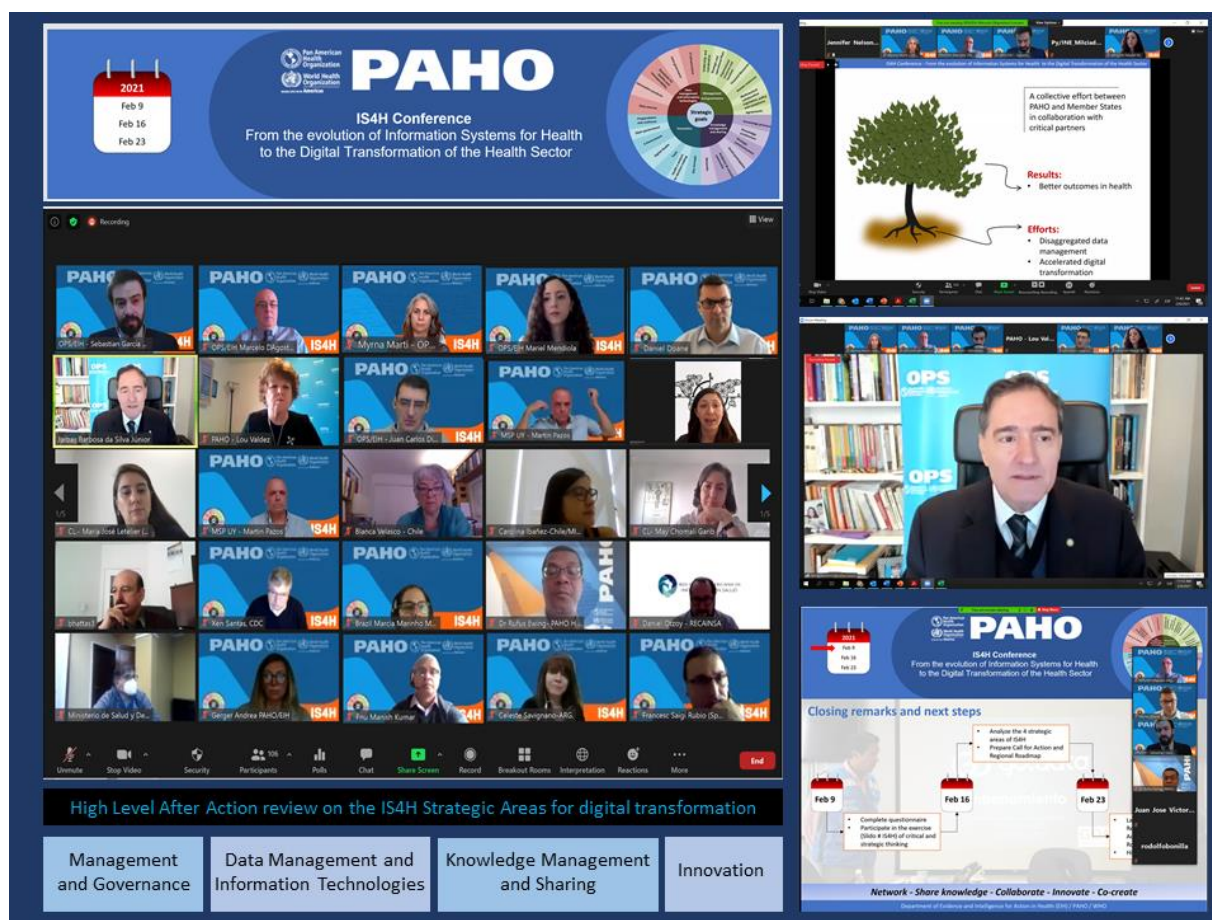
Figure 5. IS4H Conference: Welcome Remarks Session 1