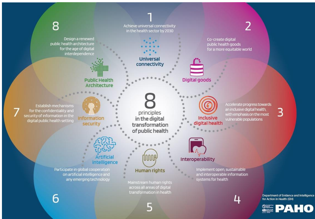
Figure 2. Eight Principles for the Digital Transformation of the Health Sector

1. Universal connectivity. It is imperative to achieve universal connectivity in the health sector by 2030, addressing the needs and challenges of people, communities, and service providers, and the benefits that will accrue to governments by positioning connectivity and bandwidth as a high priority for public health interventions.