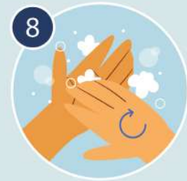
Rub your fingertips against the other hand in a rotational motion and vice versa