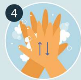
Rub the palm of your right hand against the back of your left hand and vice versa