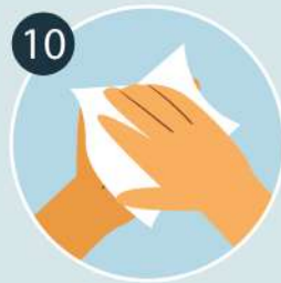
Dry yourself with a disposable towel