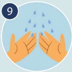
Rinse your hands with water