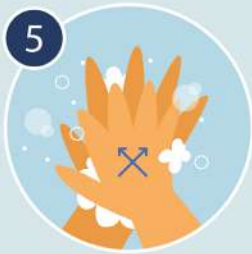
Rub your palms together, fingers interlocked