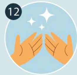
Your hands are clean