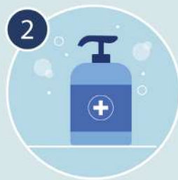
Put a sufficient amount of soap in the palm of your hand