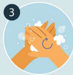
Rub your palms together