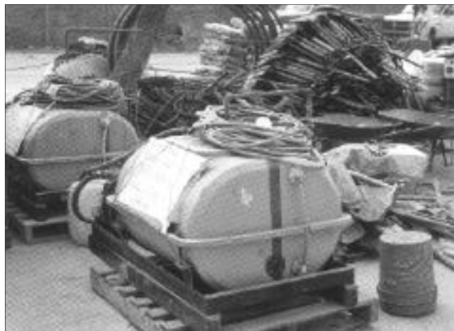
Guidelines are helpful, but daily working relationships can also improve donation practices.