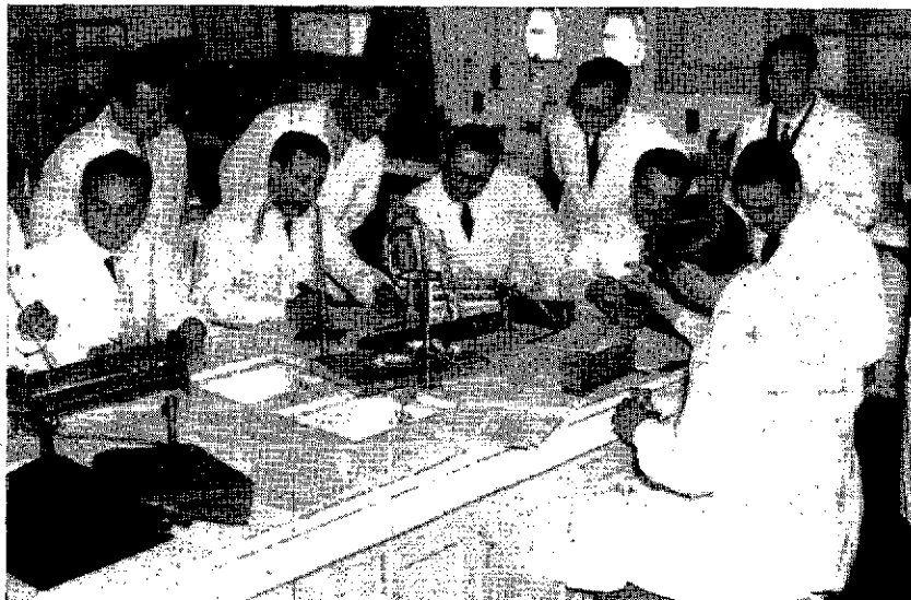
Laboratory class for veterinarians attending Twelfth Aftosa Training Course.

The first two weeks of the course were spent on lectures and demonstrations covering such subjects as the criteria necessary for the identification of a type and subtype of the aftosa virus, the importance of subtypes, the distribution and incidence of types and subtypes, the tests used in the identification of types and subtypes, the requirements for organizing a national service for the identification of subtypes, the exchange of information between countries, and the need for a regional campaign for the countries participating in the course.