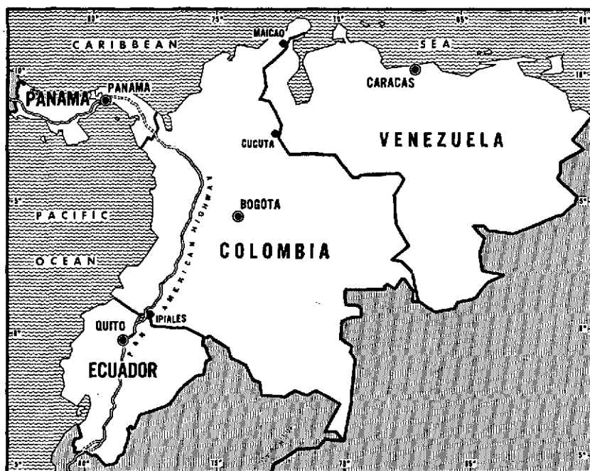
COUNTRIES PARTICIPATING IN THE INTERNATIONAL ANTI-AFTOSA CONFERENCE

One of the most important features of the Center's program during 1959 was the sponsoring of a meeting between government veterinarians from Colombia, Ecuador, Panama, and Venezuela. This was the "Conferencia Internacional Antiaftosa" (International Antiaftosa Conference) held in Bogotá, Colombia, from 12-18 April, with the collaboration of the Ministry of Agriculture of Colombia. Its purpose was to discuss at a technical level the problems common to the four countries concerned and to reach agreement on intercountry collaboration. These four countries form a natural unit for coordination of national antiaftosa programs. Panama is, of course, free of the disease, but the improvement of land communications between Colombia and Panama by the proposed extension of the Pan American Highway through Darién will expose Panama and the countries of Central America to greater risk of the spread of the disease. This gives rise to an obvious need for a high degree of collaboration between Panama and Colombia.