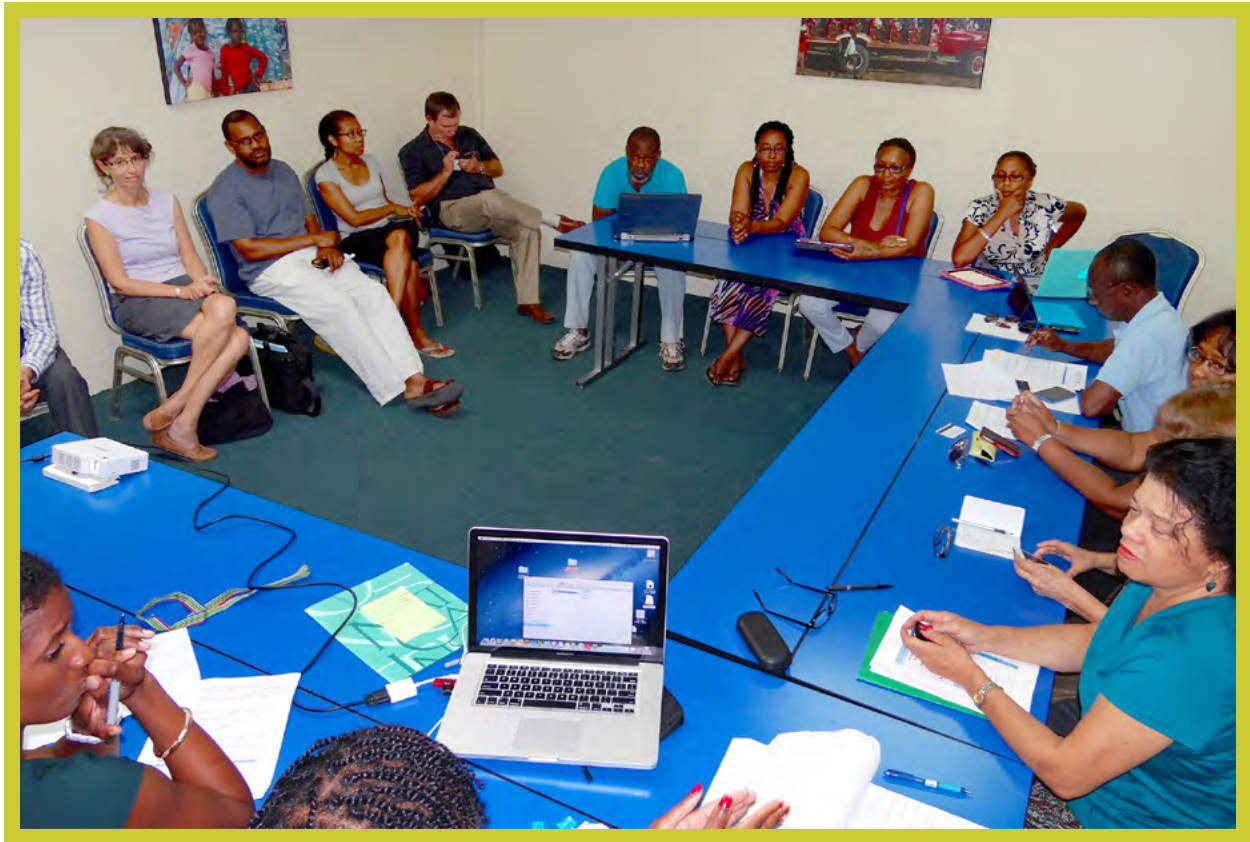
Caribbean Grant Writing and Scientific Peer Review workshop at St. Georges University, Grenada. 19 Sep 2014.

The umbrella of research capacity-building over the past ten years has also been in line with efforts to strengthen research ethics in CARICOM countries, in collaboration with UWI. Following a prior meeting in 2006, Jamaica launched the National Bioethics Committee of Jamaica (NBCJ). It was inaugurated in 2008 and formally launched in October 2009, with efforts led by key practitioners at UWI and the WHO Collaborating Center in Ethics and Global Health Policy at the University of Miami. The local officials and experts involved in this endeavor came from the Ministry of Health Jamaica, the Attorney General’s department, and all the major universities of Jamaica (Pan American Bioethics Initiative / PABI, 2009). This committee provided national-level oversight, focused on protecting human subjects involved in research, and acted as a catalyst for strengthening the understanding of ethical principles in research. It also supported the efforts of institutional ethical review boards in the country. PAHO has also supported the implementation of this model elsewhere in the Caribbean region.