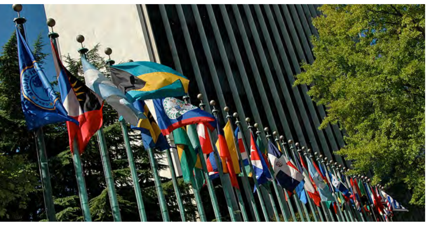
Headquarters of the Pan American Health Organization, Washington DC.