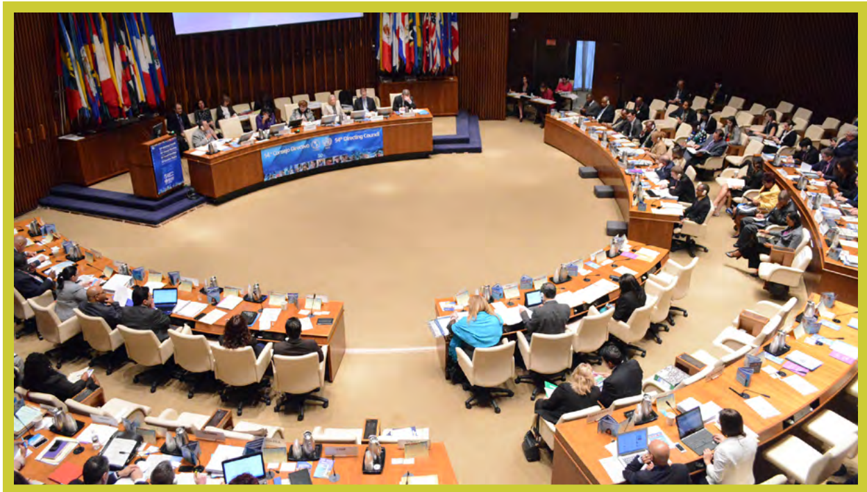
PAHO/WHO Meeting of the Directing Council.