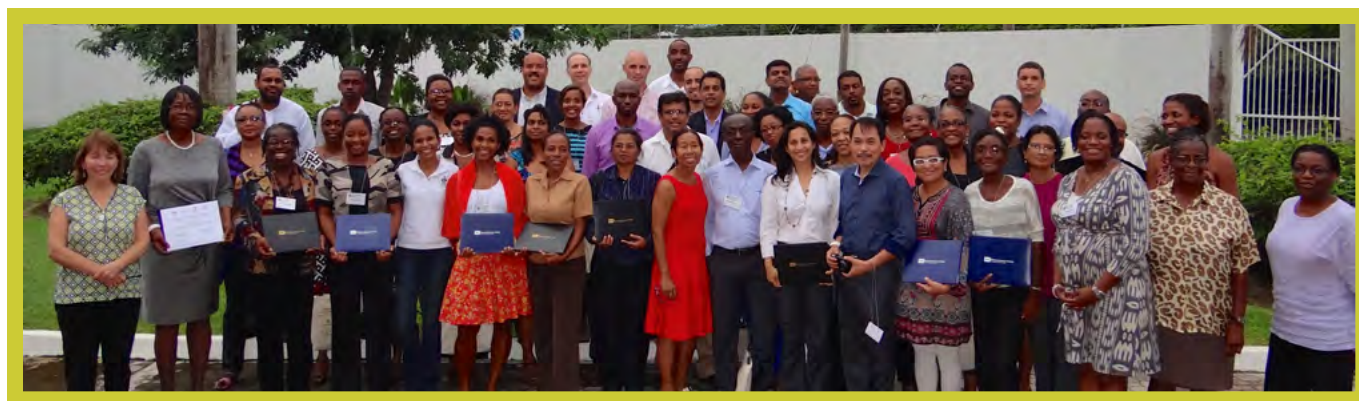
Caribbean Grant Writing and Scientific Peer Review workshop at St. Georges University, Grenada. 19 Sep 2014.

hosted by CARPHA in collaboration with SGU, PAHO/WHO, and the United States National Institutes of Health through the Center for Global Health located within its National Cancer Institute (NIH/NCI/CGH). It was the third workshop of its kind globally, with previous subregional workshops conducted in Colombia (2012) and South Africa (2013) (NIH/NCI, 2014). Organizers made particular efforts to engage domestic graduates from the Master's in Public Health Program and to continue strengthening local expertise and capacity.