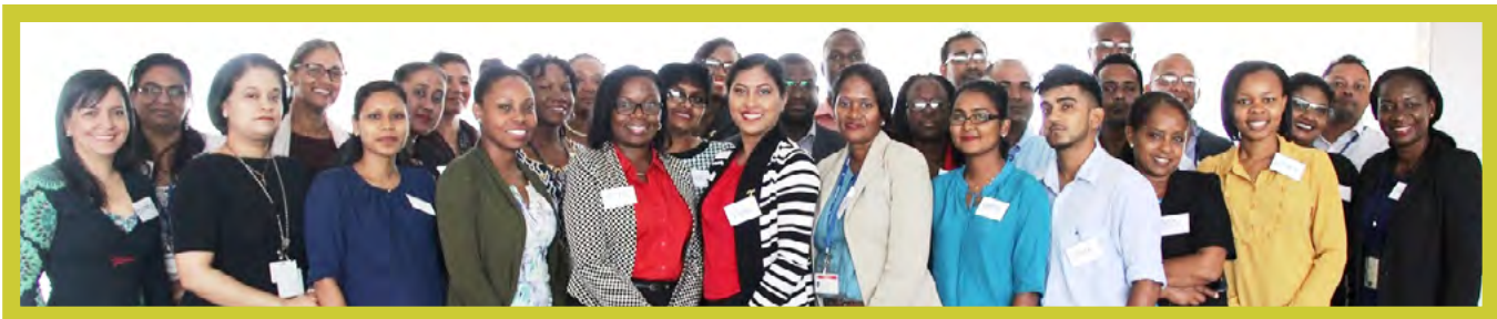
First EPPE Course in Guyana supported with trainers from UWI and Suriname, 18 Sep 2017.

International collaboration has made significant strides, but intra-regional networks for researchers in CARICOM countries remains an area for improvement. Current professional networks—such as those forged by individuals either employed or active in Cochrane, CARPHA, the ministries of health in the region, and UWI's academic departments—lack the centralization necessary to fully harness the growing and future human resources in research for health and to ensure the best leveraging of available skills. CARPHA, and more specifically CHRC, currently play the most prominent role in the region; but their high-level focus may not be geared towards the collaborative aspirations of early-stage professionals. Moreover, although the annual CHRC meeting serves as a point of action for fostering such collaboration, lack of funding blocks engagement for some potential attendees. In the case of multi-island activities, intra-regional cooperation could benefit from direct action. The possibility of marginalization also presents a significant barrier to ensuring equitable capacity-