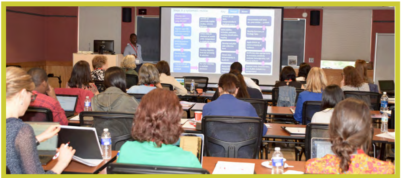
4th WHO/Cochrane/Cornell University Annual Summer Institute for systematic reviews in nutrition for global policy-making. Ithaca, New York, July 2017.

further development in the region; and continued engagement by subregional, regional, and global actors can ensure that the rewards continue in the years to come. At the time of this publication, further EPPE training in the region and the contributions made by UWI faculty members at the 2017 WHO Cornell Summer Institute provide a good prognosis for the continued success of engagement and capacity development.