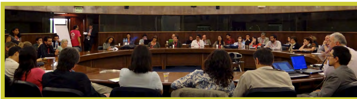
Meeting of Cochrane Global and Regional Directives with PAHO Directives and the Research Promotion and Development Unit, 19th Cochrane Colloquium in Madrid, Spain, October 2011.