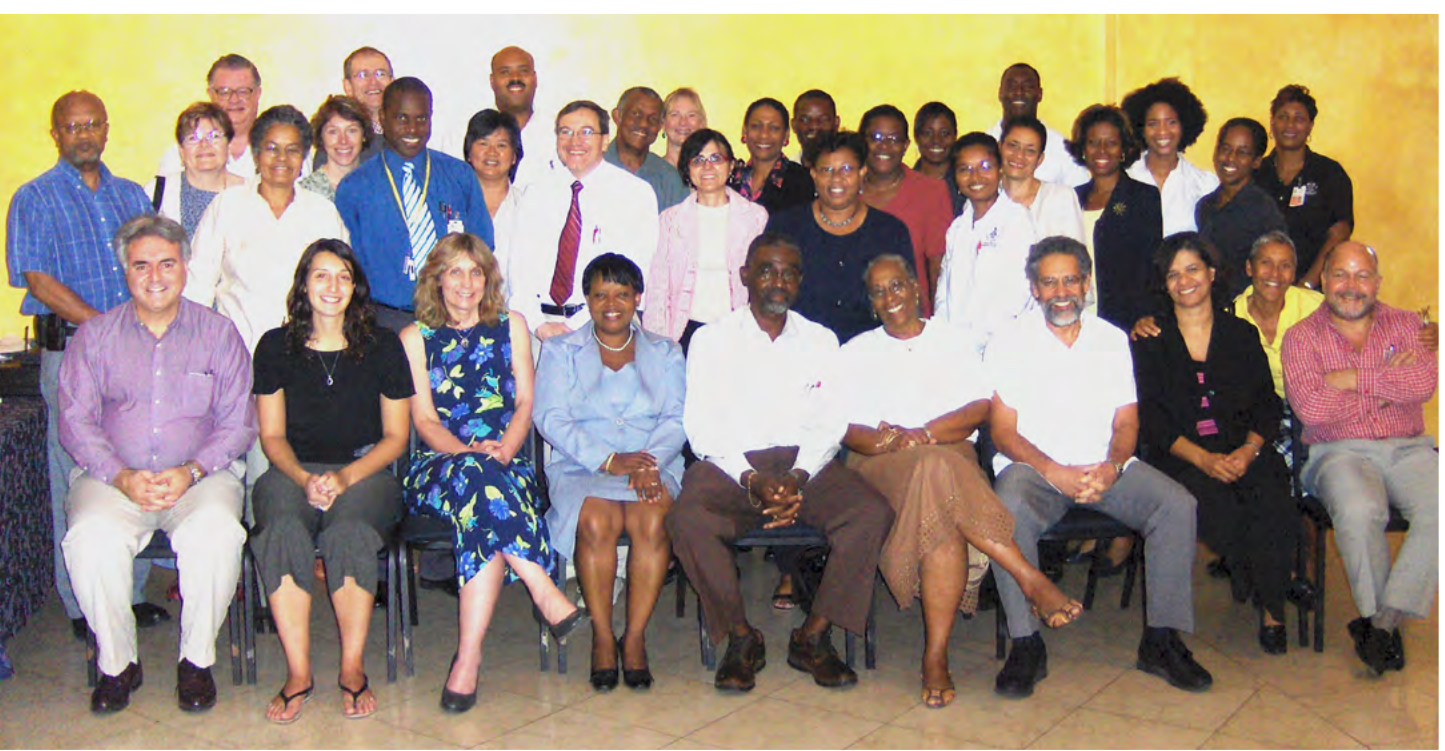
Group photo, Launch of the Clinical Epidemiology Unit at UWI and admittance to the International Clinical Epidemiology Network (INCLIN) 19 Feb 2009.