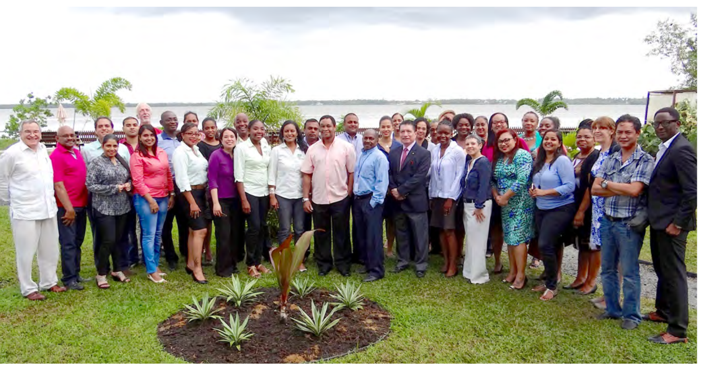
First EPPE course in Paramaribo, Suriname, 2015. October 2015.