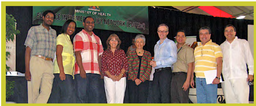
First EVIPNet workshop in Trinidad. University of Trinidad and Tobago, Port-of-Spain, 5 Oct 2009.