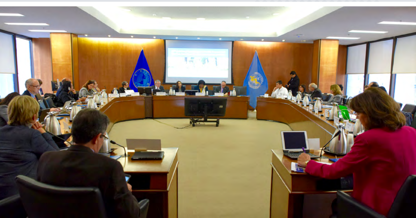
PAHO's Director, Dr. Carissa Etienne opens the 46th Session of PAHO's Advisory Committee on Health Research. Washington DC, 28 Nov 2017.