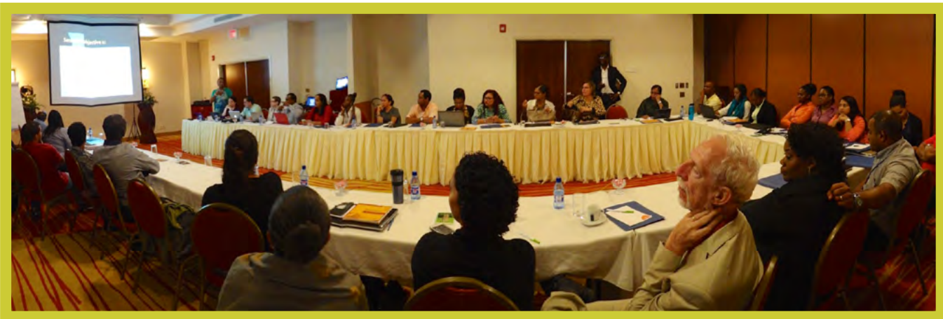
Plenary session. EPPE course in Paramaribo, Suriname, 2015. October 2015.