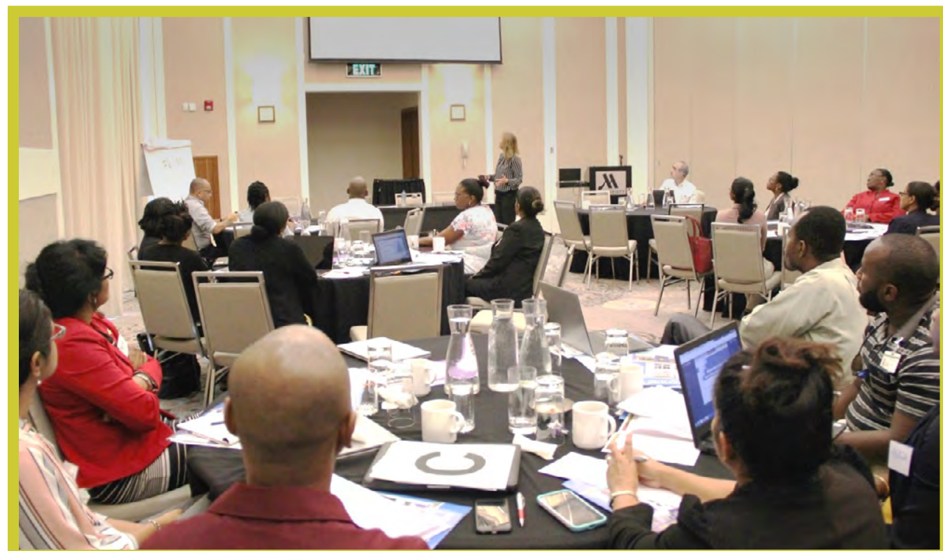
Introduction to Clinical and Epidemiological Research Methods. Georgetown, Guyana, August 2017.

** Estimate; the total figure may be higher as not all students in graduate programs at UWI and SGU taking EPPE in their programs are accounted for