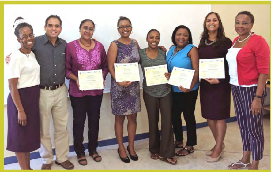
EPPE Training of Trainers for the Caribbean with support from CIDEIM and UWI. Jamaica, 5 May 2017.

management skills in the region, which now has eight trainers—thus expanding the amount of available expertise in Barbados, Grenada, Jamaica, Trinidad and Tobago, and Suriname. Directives have also fostered training in how to conduct and utilize systematic reviews, thanks to the work of Cochrane Caribbean and some epidemiologically-focused workshops that UWI faculty members run in association with CARPHA. Notably, these training initiatives have proven their sustainability and have continued