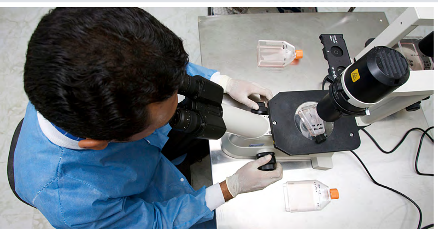
Art for Research Project, exhibition Research on the Move.