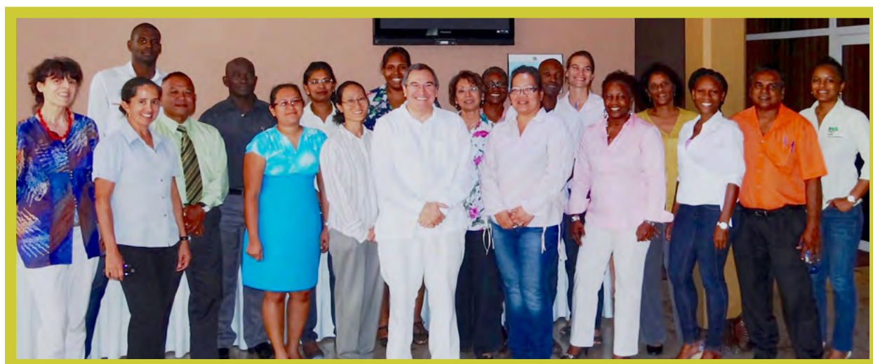
Workshop on Implementing the Policy on Research for Health in Suriname, Paramaribo, October 2014.

The bioethics relationship between UWI and the University of Miami was further strengthened by a PhD Fellow from the WHO Collaborating Center in Ethics and Global Health Policy being placed at UWI. Subsequently, the overall process also developed regional capacity by holding workshops and developing online educational modules from the virtual platform Collaborative Institutional Training Initiative (CITI), which has enabled significant access and usage within the Region. Seminars, presentations, and training events were also carried out between 2009 and 2013. 23 These built upon their own momentum by obtaining institutional approval within UWI, led by core faculty, for establishing an ethics center. Such a center would harness the value of the UWI campus network by providing a sustainable research ethics structure for the entire region (PABI, 2009). Although implementation has not yet taken place, the WHO Collaborating Centre in Ethics and Global Health Policy at the University of Miami—along with other parties involved—still believe that there is enough enthusiasm to re-institute the development process.