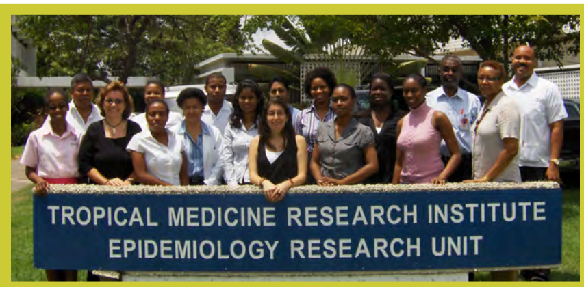
EPPE training at UWI, Jamaica, Dec 2007.