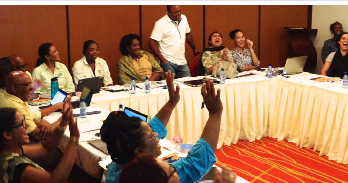
First EPPE course in Paramaribo, Suriname, 2015. October 2015.