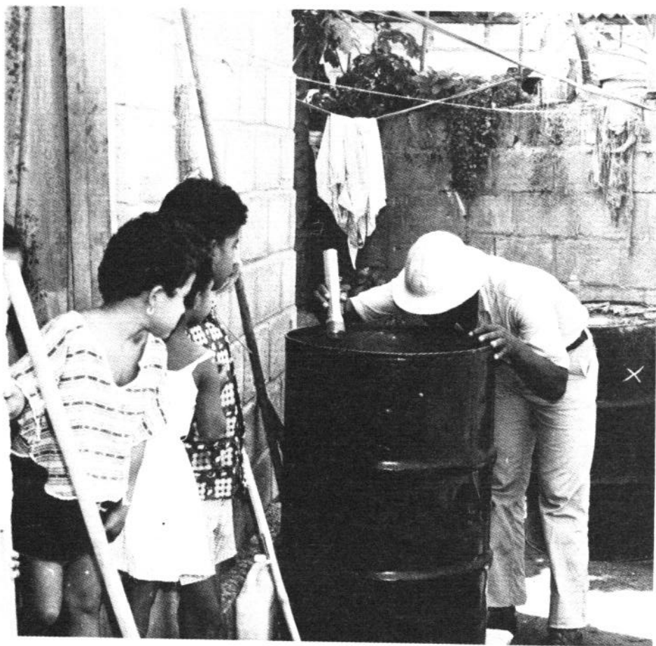
Anti-larval measures. Above, a health worker inspects household water drums in Barranquilla, Colombia. Below, sanitation workers remove an old tire in Espinal, Colombia. Elimination of all potential water-bearing containers that can be removed, plus periodic inspection and treatment of the rest, provides the foundation for A. aegypti control and eradication.