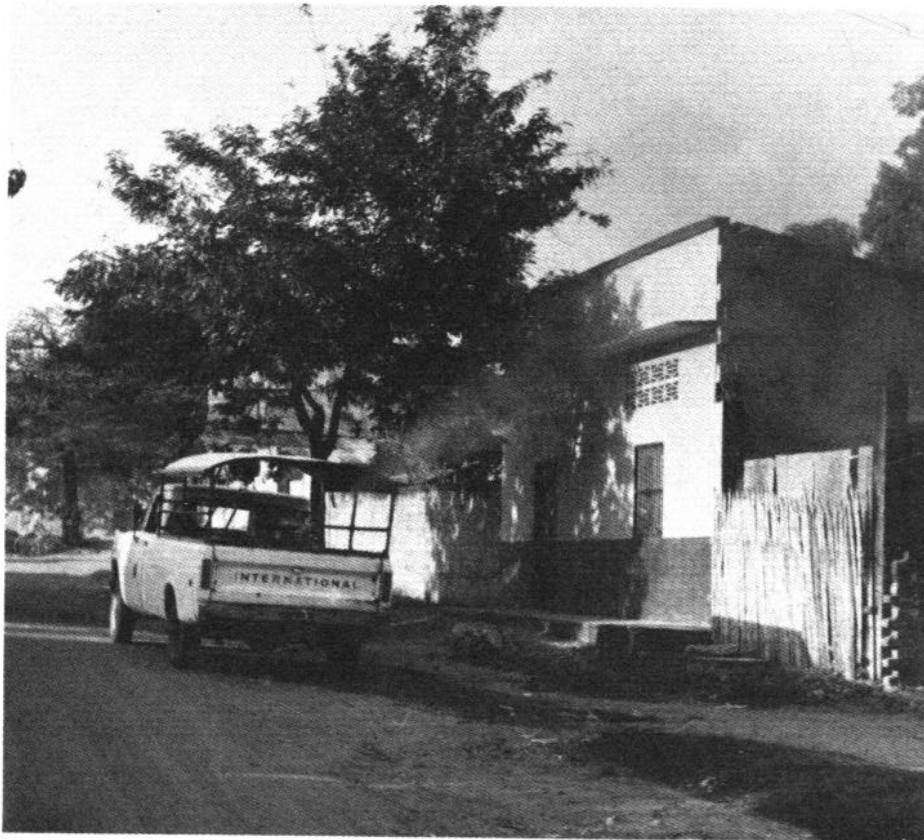
Applying adulticides. Above, health workers in Ocaña, Colombia, provide an intradomiciliary treatment. Below, a truck-mounted sprayer makes an ultra-low-volume application of insecticide in Guamo, Colombia. Both house-to-house and open-air spraying are typically directed against A. aegypti adults when reduction of the adults rather than local eradication of the species is the aim.