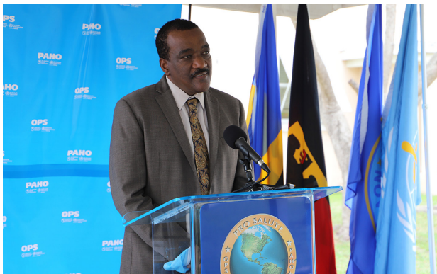
Lt. Col. Hon Jeffrey Bostic Minister of Health and Wellness, Barbados