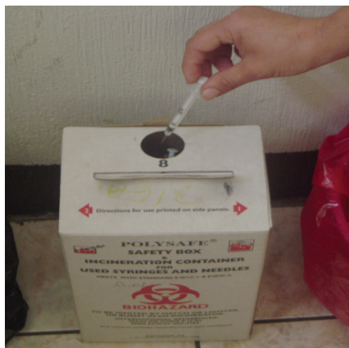
Photo 2. Proper final disposal of used syringes and needles in safety boxes.