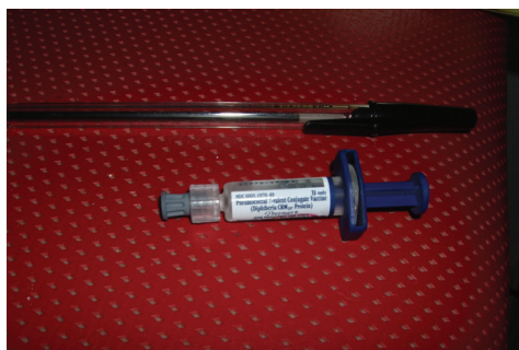
Photo 1. Pneumococcal vaccine syringe.

An important distinction must be established regarding the technical difference between incinerating and burning. Incineration is a process that transforms something into ashes, and results from achieving temperatures above 1200°C. At lower temperatures, waste is only burnt, with the risk of producing toxic substances such as furans and dioxins. During the workshops, countries were advised to analyze the cost of the different options and choose the most appropriate technologies for their needs.