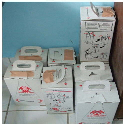
Photo 3. Sealed safety boxes waiting for transport.