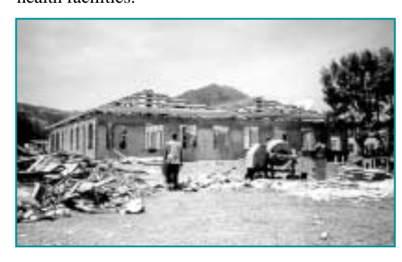
The JN France Hospital in St. Kitts and Nevis being repaired once again following Hurricane Georges.

loss of 5,829 hospital beds in three major health facilities—either because they were completely destroyed or because they had to be evacuated. This earthquake marked a turning point for PAHO/WHO, and the Organization began to focus a great deal of attention on disaster mitigation in health facilities.