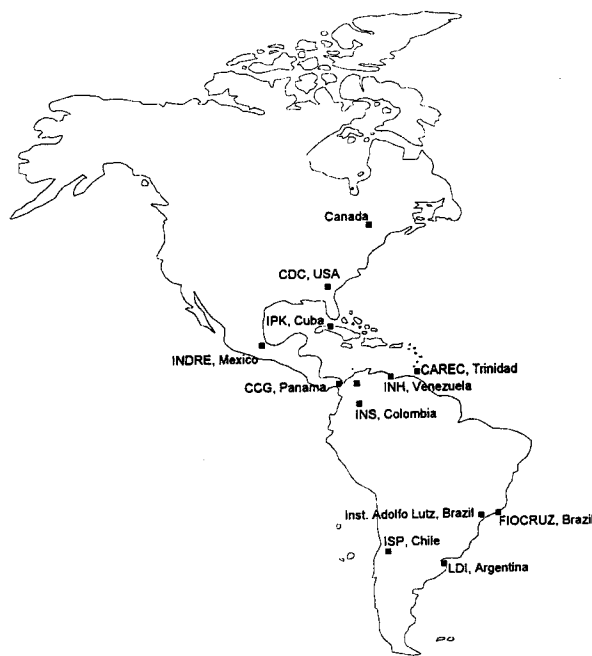
Figure 1 PAHO Measles Laboratory Network

If this information is not provided, the laboratory may reject the specimen.