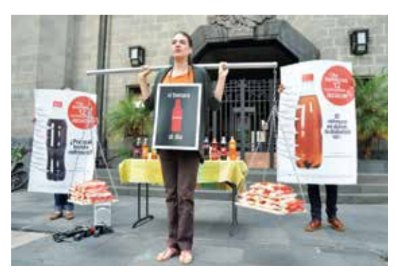
"12 tablespoons" campaign on the steps of the Ministry of Health. Mexico City, 22 May 2013.

During a demonstration on the steps of the Ministry of Health, several people carried bags containing 22.99 kg of sugar, which