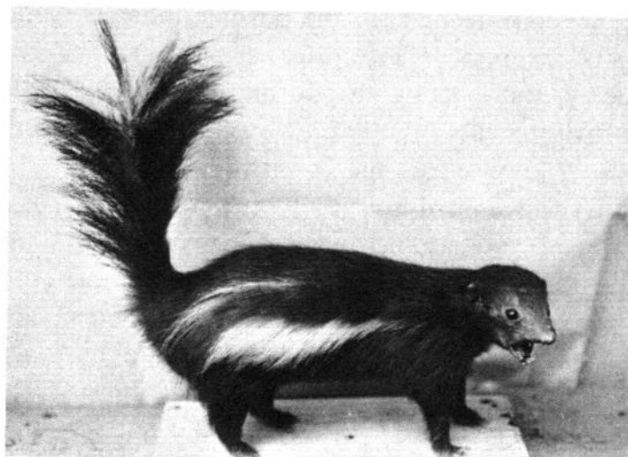
A few of the animals swept up in the rushing stream of international commerce: (1) upper left—howler monkey ( Alouatta palliata ); (2) center left—nine-banded armadillo ( Dasypus novemcinctus ); (3) lower left—ocelot ( Felis pardalis ); (4) upper right—small grey fox ( Urocyon cinereoagustus ); (5) lower right—hog-nosed skunk ( Conepatus tropicalis ).

here the specific zoonotic diseases and methods for their control, since many excellent reviews have already been published (3-9). Instead, a discussion of the general categories of health problems with which we are concerned, illustrated by a few specific examples, will set the stage for the papers to follow. It should be emphasized that although our records and experience mainly involve animals imported into the United States, this does not mean that health problems are associated only with animals foreign to this country. There are many zoonotic diseases and health hazards we must claim as our own. Diseases, like wildlife species, are not respecters of international boundaries. As sharers of a single planet, we all owe the same careful attention to safeguarding the world against exportation of disease from one area and importation of disease into another.