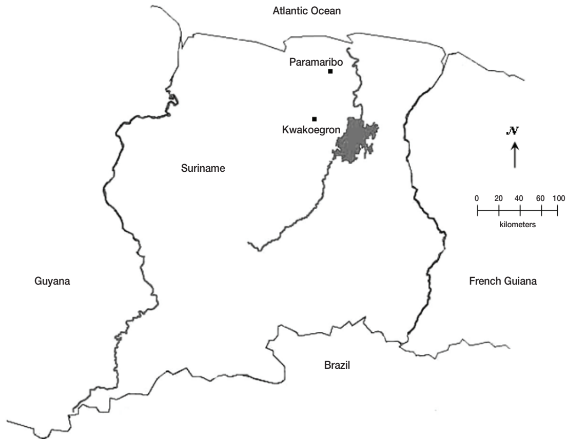
FIGURE 1. Map of Suriname showing the Kwakoe Gron study site relative to Paramaribo, the capital city, 2006

uted. This does not imply censorship of data or of publication, but rather, the opportunity to make clear the community's views about the interpretation prior to final publication;