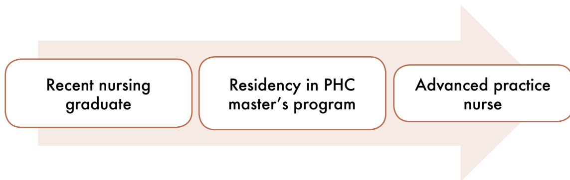
Figure 3. Model 3. APN training plan for recent nursing graduates

APN roles are also determined by national laws and regulations. Professional activities are regulated to protect the population from unsafe practices, ensuring service quality, promoting continuing education, and providing users and the public with the best professional competencies. As a result, to make the changes necessary for implementation of APN, current nursing policies and regulations must be adapted in the different countries.