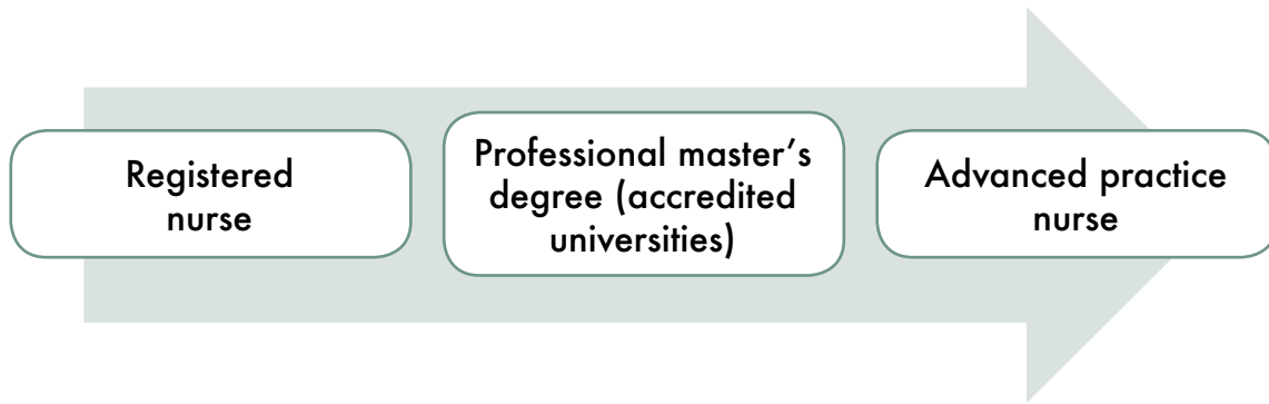
Figure 1. Model 1. Education plan for registered nurses

In the second plan (Model 2), registered nurses with professional experience in PHC units would be trained through specific and complementary advanced practice nursing programs offered by accredited universities. The complementary programs would be integrated into a curriculum for theoretical and clinical upgrading, based on core competencies of APN (Figure 2).