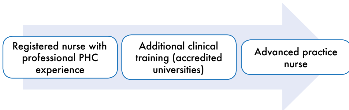
Figure 2. Model 2. Training plan for registered nurses with professional PHC experience

In the second plan (Model 2), registered nurses with professional experience in PHC units would be trained through specific and complementary advanced practice nursing programs offered by accredited universities. The complementary programs would be integrated into a curriculum for theoretical and clinical upgrading, based on core competencies of APN (Figure 2).