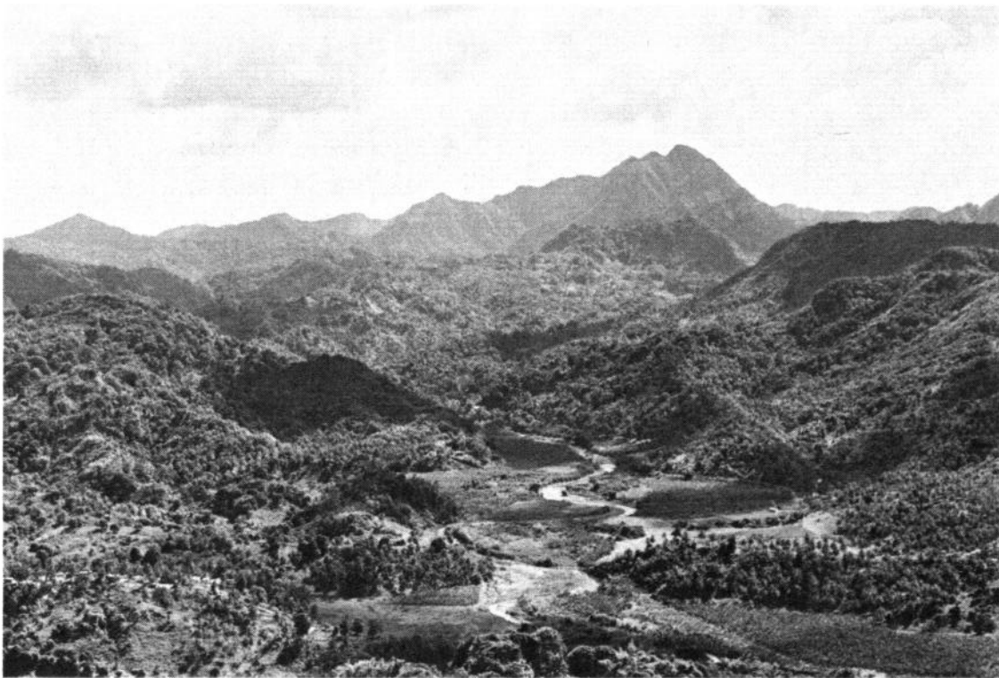
An alluvial valley in Saint Lucia. Transmission of schistosomiasis may occur in the river and its tributaries during the dry season when conditions are suitable for a build-up of B. glabrata colonies.

B. glabrata is widespread and is the only Biomphalaria species recorded in Saint Lucia. Sturrock (24) discusses the transmission pattern in Cul-de-Sac Valley and shows that the most important sites are the streams where snails from high-level marshes can establish themselves during the dry season. This snail distribution pattern, which I have found in other valleys, is typical of mountainous areas with heavy rainfall. The ecology