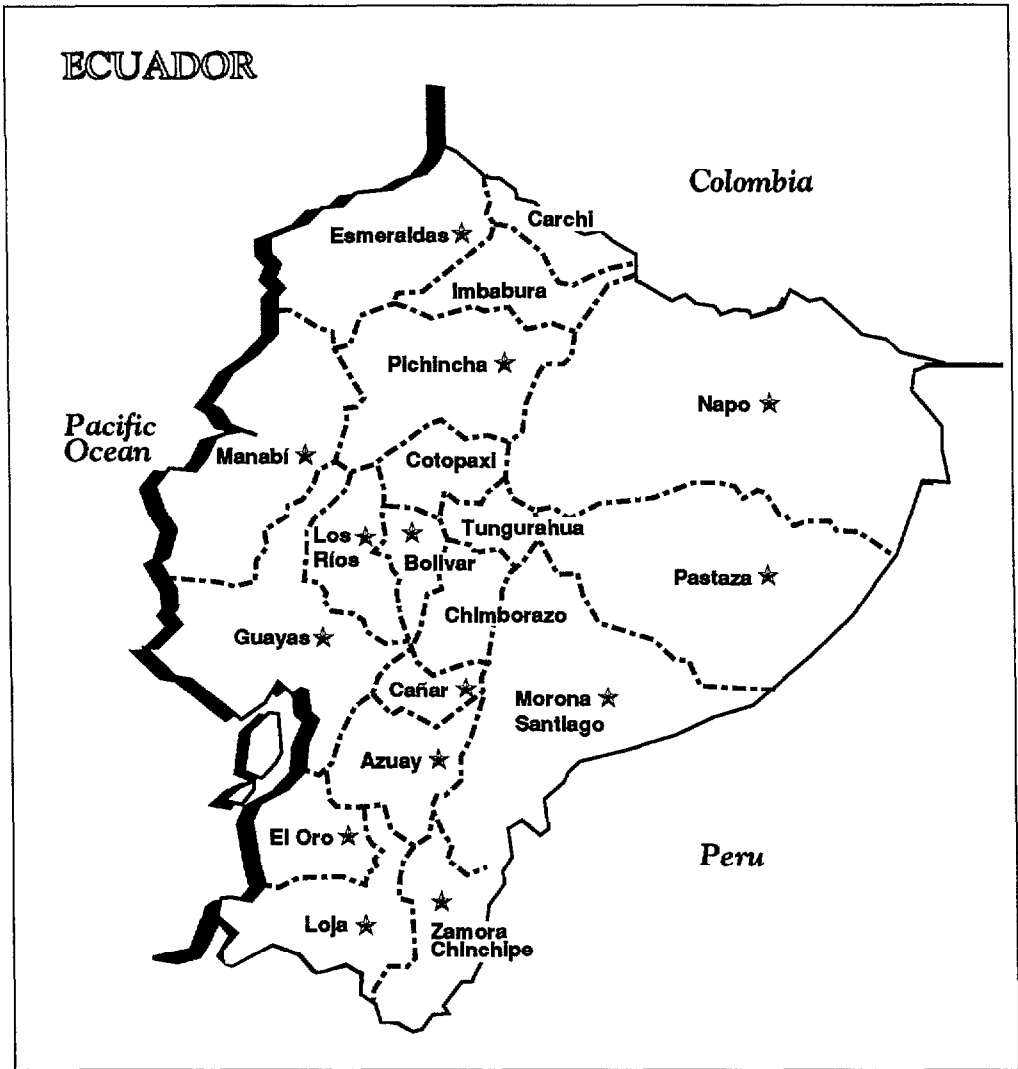
Figure 1. A map showing all of Ecuador's 20 provinces except Galápagos. Asterisks denote departments with endemic leishmaniasis.

diagnosed clinically and/or parasitologically, and were then registered at the Statistics Department of the National Institute of Health and Tropical Medicine and the Epidemiology Division Subsecretariat (Section II) of the Ministry of Health in Guayaquil (Table 1). Most of these cases had occurred in the provinces situated along the Pacific lowlands and western slopes of the Andes—most nota-