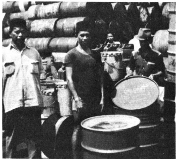
Used pesticide containers being sold in open market.

Mention should also be made of the poisoning potential of pesticide warehouses when they fall into disrepair. Pesticide spillage occurs frequently, and if the floors are not concrete