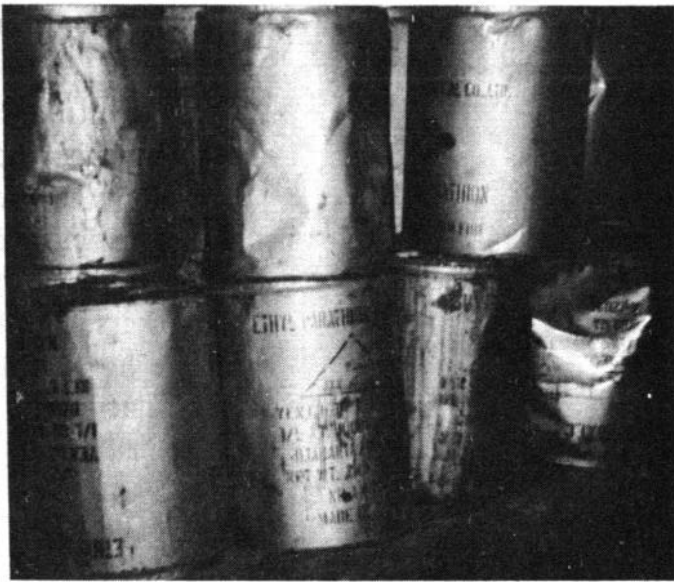
Leaking pesticide drums containing concentrated parathion.

pesticide transportation, shipping, and storage. Special care should be exercised at dockside to avoid damaging any pesticide drums. The chemicals should then be stored in a concrete building, off the ground on a firm trestle, and separate from food supplies. When being transported from the warehouse, the drums should be firmly secured and kept separate from any food.