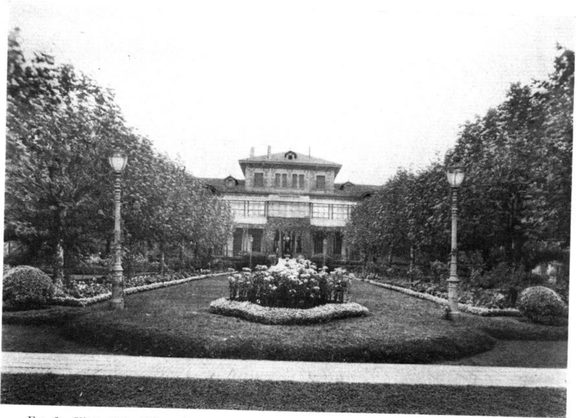
FIG. 3.—View of the "Elena Laroque de Roffo" hospital for men. This was the only building in existence at the inauguration of the Institute in 1923.