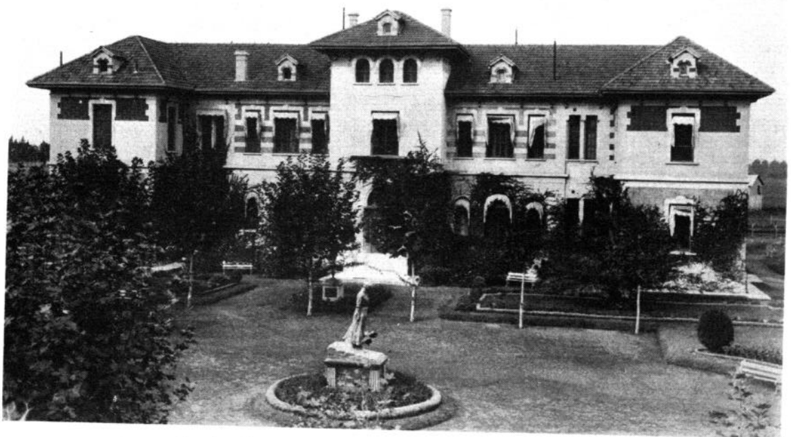
FIG. 4.—"Emilio J. Costa" building for scientific research.