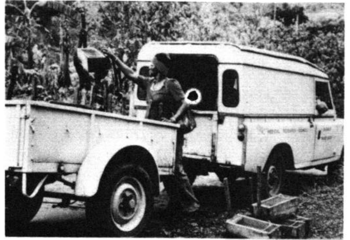
Traps are unloaded from vehicle and trailer.