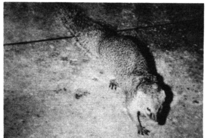
A captive mongoose shows wariness by its fluffed-out tail.