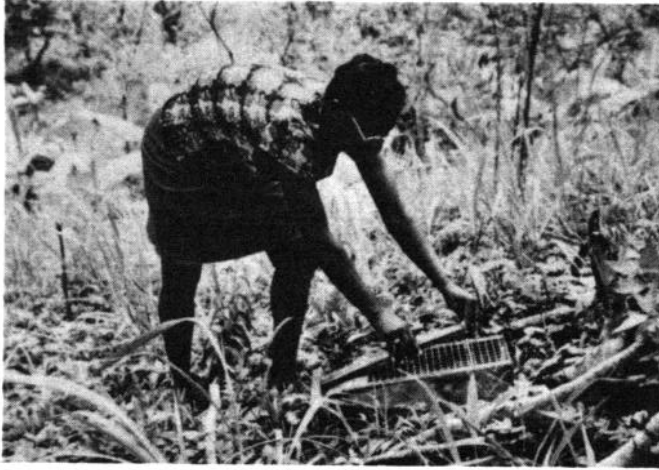
A mongoose trap is set in the field.