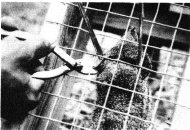
A trapped mongoose undergoes ear-tagging.