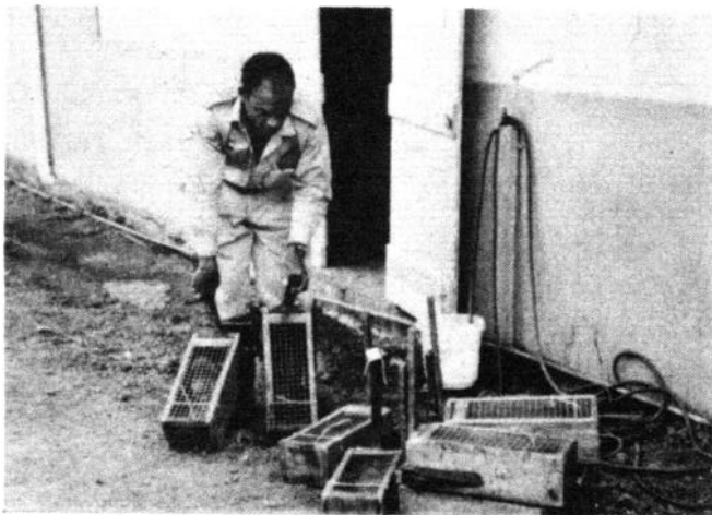
Mongoose are collected at the Rabies Laboratory.